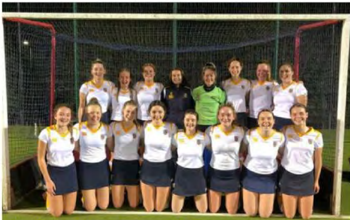
1stXI hockey team, 21-22