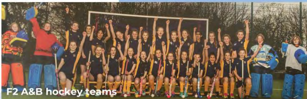
F2 A&B hockey teams