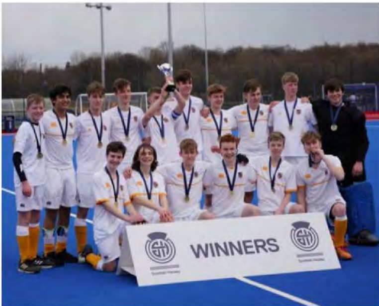
The boys 1XI hockey team won the Aspire Cup Competition with an impressive 6-2 success in the final!