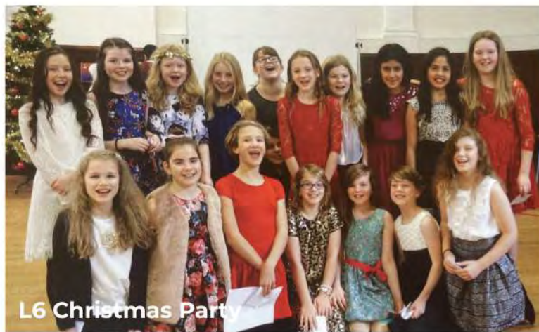
L6 Christmas Party