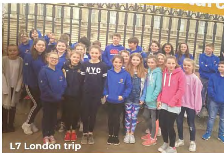
L7 London trip