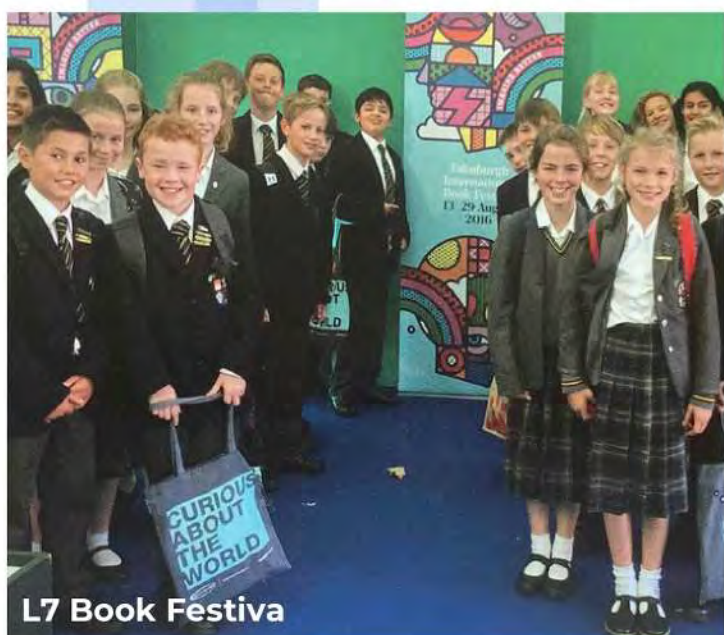
L7 Book Festival