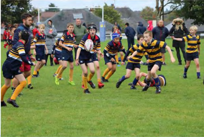
It was a successful season for the Rugby teams, who for the second year have been crowned the winners of the Inspiresport `boys National Schools Conterence!