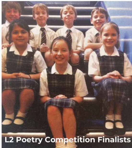
L2 Poetry Competition Finalists