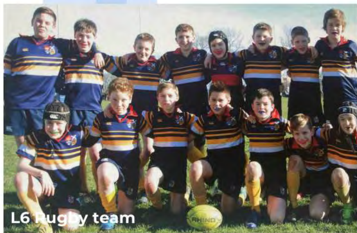
L6 Rugby team