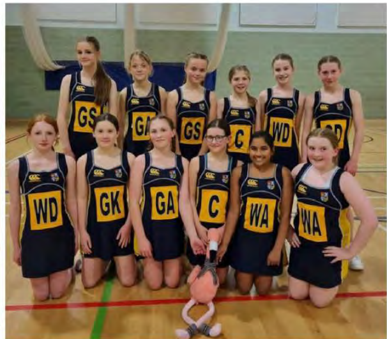
Our HSD netball teams were undefeated all season!