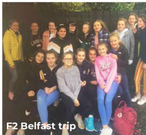
F2 Belfast trip