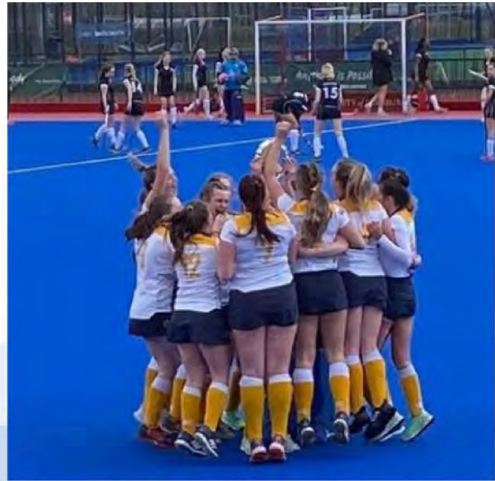
The girls 1XI team were the Scottish Plate Champions!!!