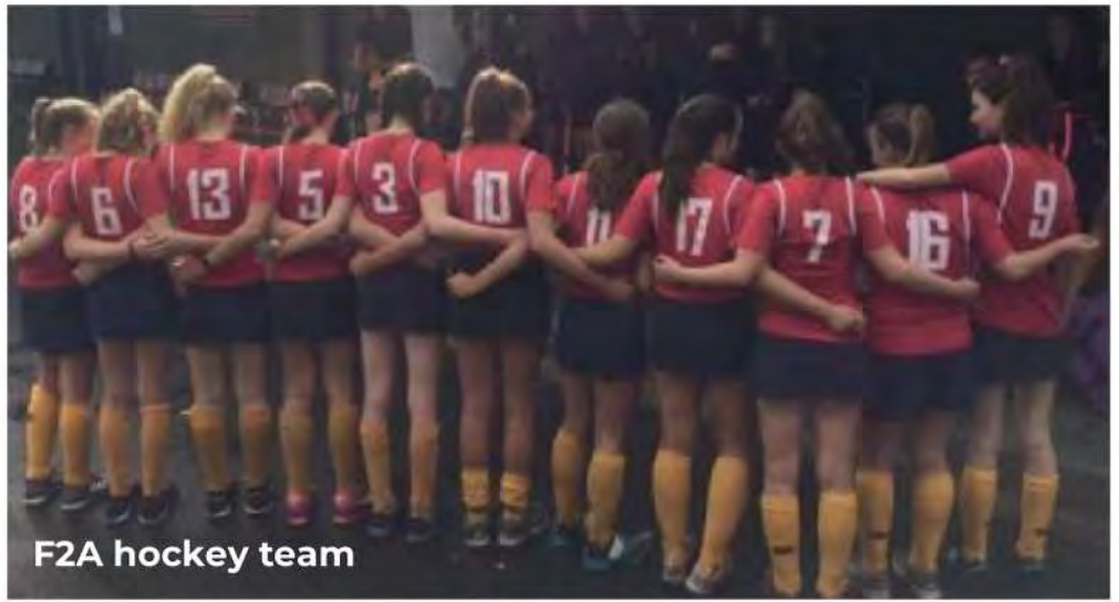
F2A hockey team