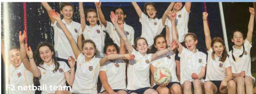
F2 netball team